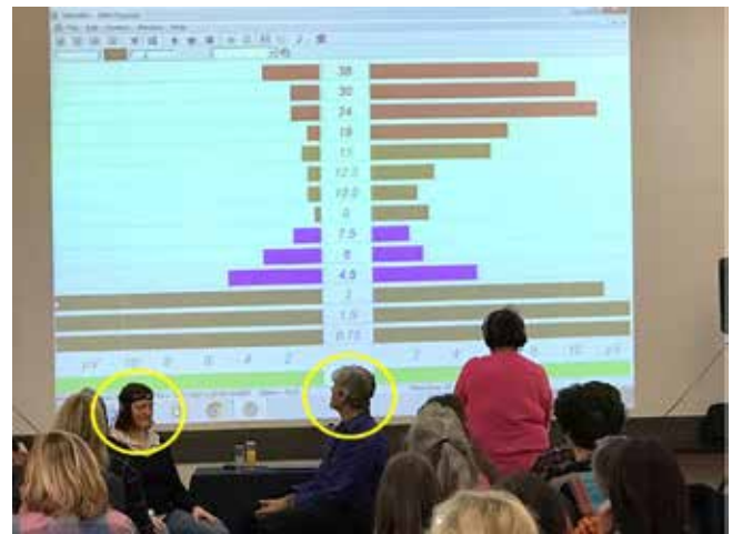
Figure 1. A demonstration subject (left) wearing EEG sensors as the author (right) conducts a tapping session with real-time EEG changes projected for a conference audience.

including desirable changes in the expression of genes involved with learning, emotional regulation, neuroplasticity, synaptic connectivity, and building white matter in the brain. 59 A 10-session EFT program treating 16 veterans with PTSD found that the treatment upregulated the interleukin family of genes, which influence inflammation and immunity. 60